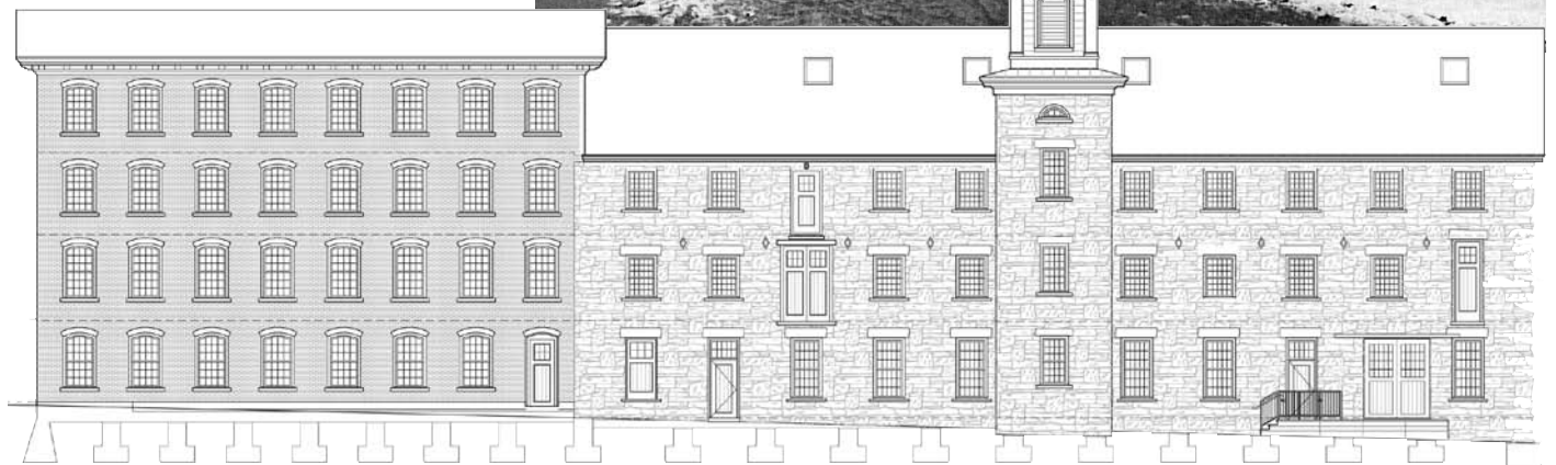
The north side of the mill building in the 1880s and the planned elevation.